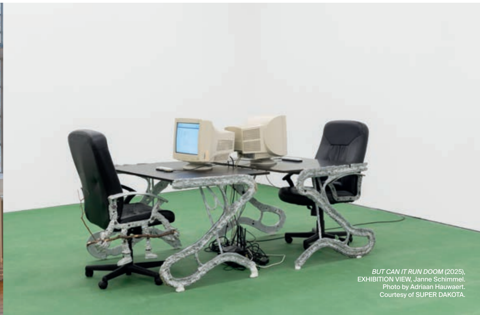
BUT CAN IT RUN DOOM (2025), EXHIBITION VIEW, Janne Schimmel.

This piece is part of the 4th major outcome of the “mut[e]//tations” installation series, exhibited here at Camden Art Centre during New Contemporaries 2023