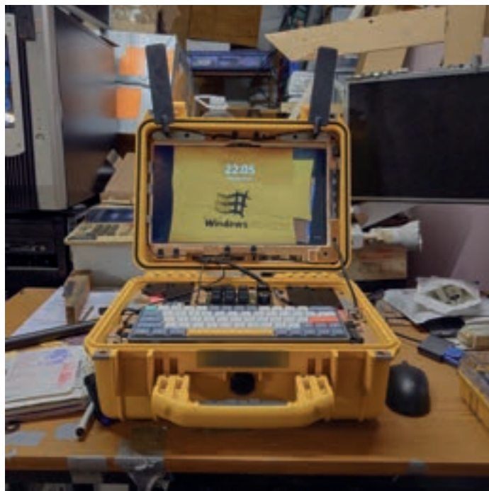
nuclear football (2024), Zayd Menk.

A functional sculpture that serves as my primary computer, with PC components mounted to plywood and housed in a waterproof Peli case, attempting to exist simultaneously as both art object and tool.