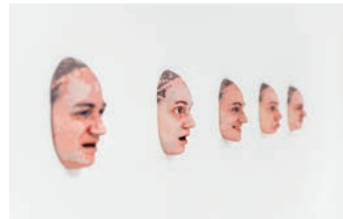
BUT CAN IT RUN DOOM (2025), STRANGE LOOP, Janne Schimmel.